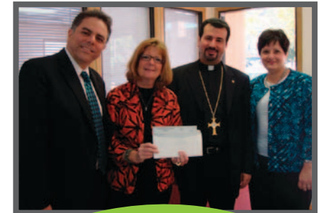
Members of St. George Antiochian Orthodox Church presenting a check for $2,000 to the Sulzbacher Center.