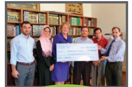
The Islamic Center of Northeast Florida presents a $5,000 check to the Sulzbacher Center.