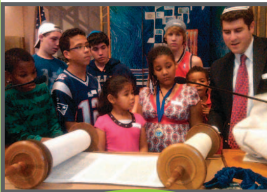
Sulzbacher Center Children's Program Attends Sukkot at Jacksonville Jewish Center.