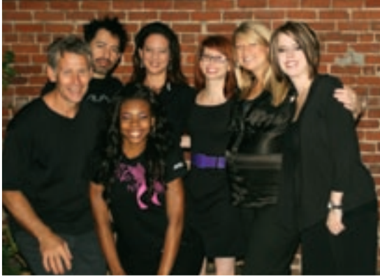
Daniel James Salon staff

... and our residents feel great when stylists from Daniel James Salon come to the Sulzbacher Center. The salon's hair stylists come once a month to provide free haircuts to the men, women and children living at Sulzbacher. They offer our residents everything from a short haircut for a man going on a job interview, a totally new hair style for a young mom, or a cool mohawk for a boy's fourth birthday. A new haircut that provides a much needed boost of self esteem is just part of the comprehensive services we provide with the help of our community partners.