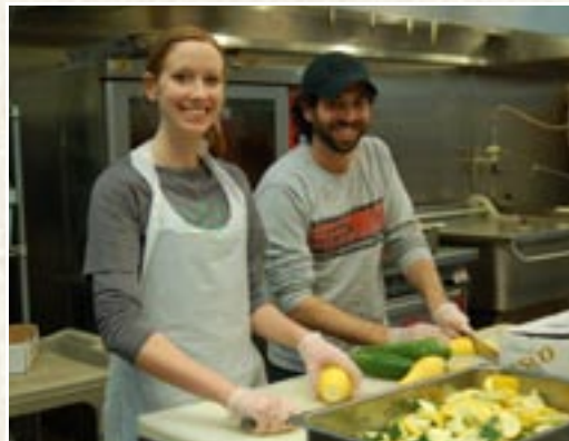
Native Sun employees at work in the Sulzbacher Center kitchen

For the third year in a row Native Sun has chosen the Sulzbacher Center as its GreenApples Charity for the month of December. Native Sun helps raise awareness about the Sulzbacher Center by collecting toiletries and cash donations at their two locations in Mandarin and Baymeadows. The cash that is collected is used to sponsor meals at the center that Native Sun employees volunteer to cook and serve.